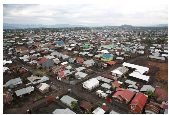
Figure 1 - Goma