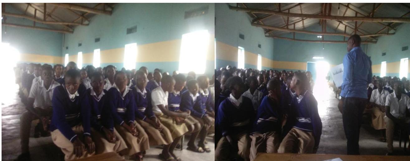
Pic shows the training session in Kamonyi district , Southern province

We held training on anti-corruption in one school in Southern province. The training content is to teach integrity by identifying the different types of local corruption, aspects of corruptions and bad manners in schools. The aim is to warn pupils in order to grow up with the spirit of integrity.