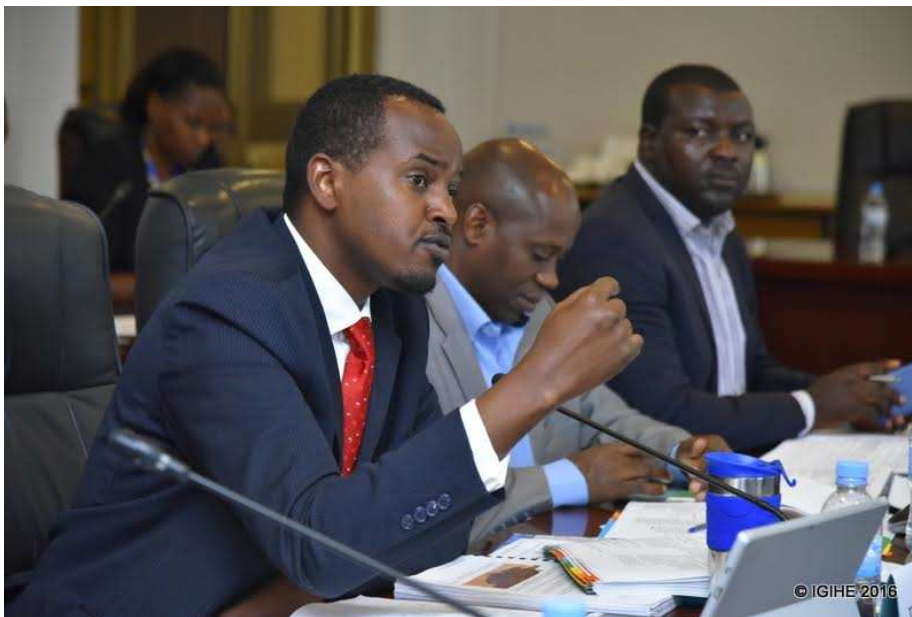
Leaders appear in The Public Accounts Committee (PAC) in the Parliament of Rwanda